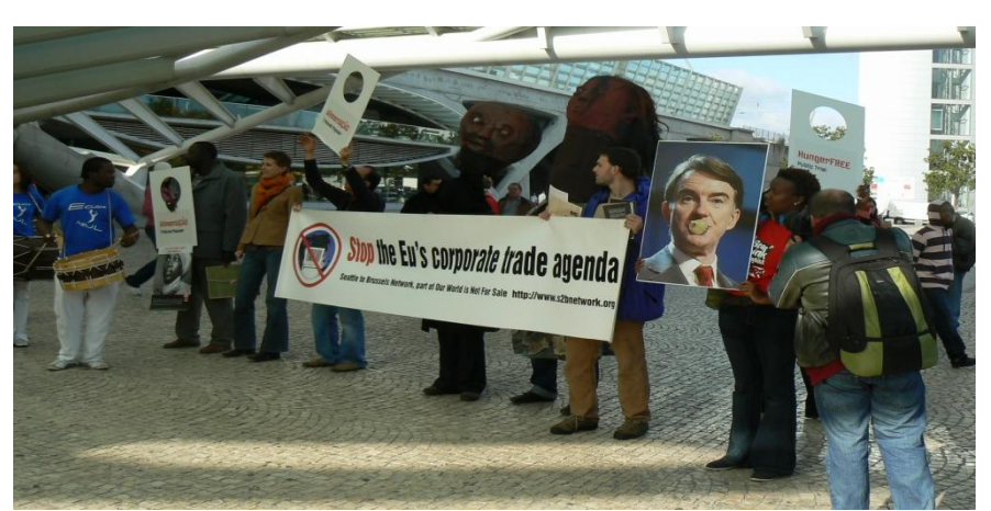
Partners from REDSAN-PALOP manifested during the Europe-Africa Summit (2007) against the economic partnership agreements of EC with the ACP countries.

Major advances achieved by REDSAN-PALOP so far have been the following: