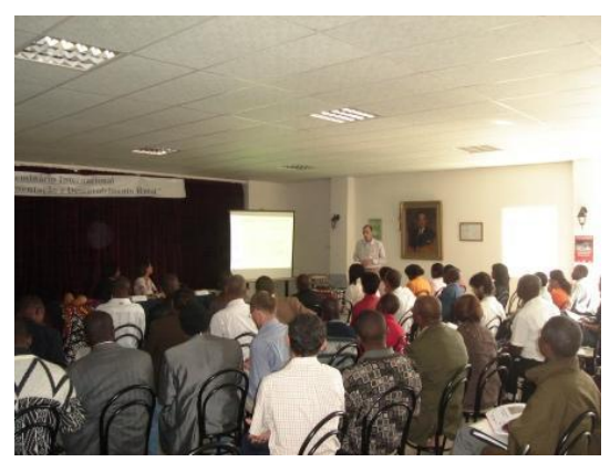
Participants of the International Seminar on Right to Food and Food Security held in Angola.

The completion of this seminar in Angola was very important because it occurred at a particularly opportune moment for the involvement of civil society in the discussion on the construction of FSN policy at the time beginning to be formulated in the country. This event had a wide media coverage, with the participation of central and local governments and enabled the sharing of experiences with civil society networks in other Lusophone countries such as ROSA from Mozambique and representatives of CONSEA from Brazil. At the end of the seminar, the organizations felt that particular attention