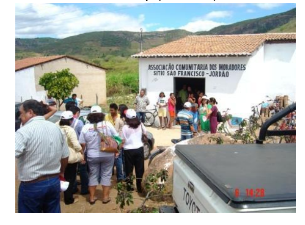
Partners from REDSAN-PALOP visit communities and exchange experiences with Brazil.

The FBSSAN is an important articulation of entities, individuals, social movements and institutions dealing with the issue of FSN. The Forum is one of the main interlocutors with the government to discuss policy of FSN featuring affiliated forums at municipal and state levels. Throughout its history, FBSSAN entered into global networks related to the theme, such as the Global Forum of Food Safety and Nutrition, the International Network for the Human Right to Food (FIAN), the Inter-American Network for Agriculture and Democracy (RIAD) or the Global Alliance for Nutrition and Human Rights (WANAHR).