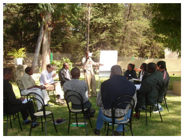
ROSA sharing their experience with other Lusophone countries in 2007.

The path taken so far by ROSA, in Africa, demonstrates the ability to mobilize civil society organizations regardless of whether there are resources assigned by