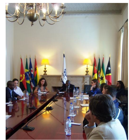
Partners from REDSAN-PALOP gathered in a meeting with the Executive Secretary of CPLP in October.

Conference of Heads of State and Government of