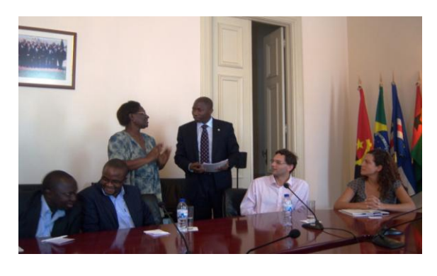
CPLP Executive Secretary receives contributions of REDSAN PALOP for the regional strategy of SAN.

The REDSAN-PALOP actively participated in the mobilization and advocacy with national governments and at regional level in view of the openness and encouragement expressed for the purpose by the Executive Secretariat of CPLP and FAO.